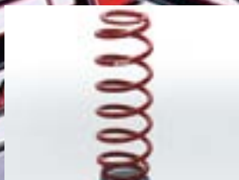
XT BARREL SERIES